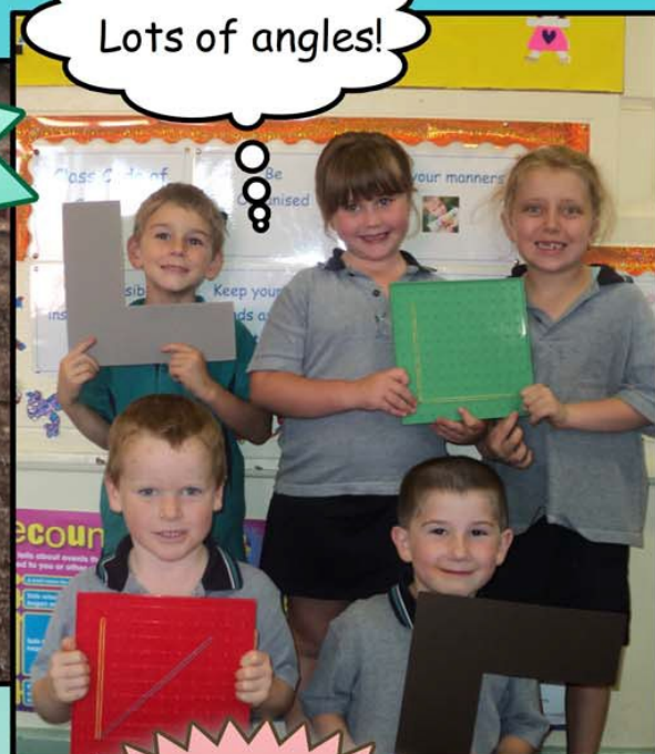
Lots of angles!