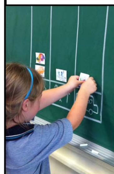
ANASTASIA CAN MAKE GRAPHS USING PICTURES.