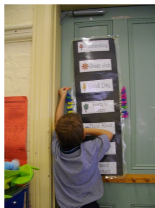
Tom is moving his peg up on our behaviour ladder.