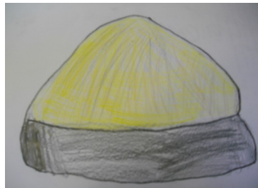
An iron age Celtic roundhouse drawn by Ashten

In Brittany there were lots of roundhouses. In Brittany there are over four thousand standing stones. At Brittany there are lots of boats, lots of islands and lots of seas.